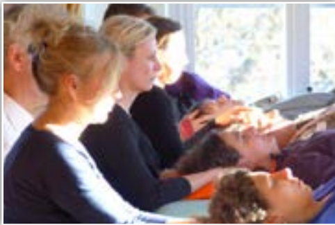
Our first German Module 2 course in Bernried