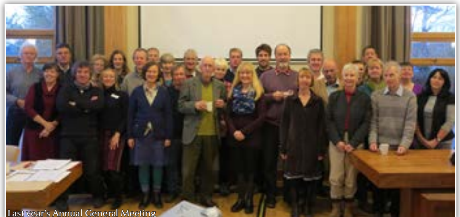
Last Year's Annual General Meeting

In addition, new graduate bursaries of £150 were given to all recent graduates booking onto M2, and vouchers of £75 given to all M1 students for use on further Pathway courses.