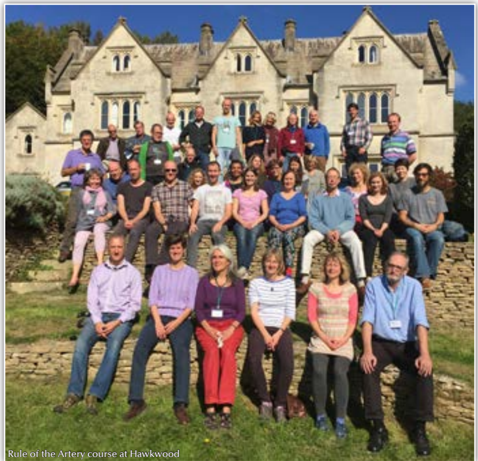
Rule of the Artery course at Hawkwood

minutes. There is a need for Spanish and German faculty members.